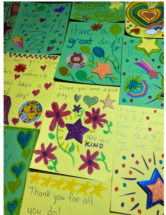
Photo caption: These cards were made by the 5th–8th grade children for the staff at a local day program that supports adults with physical and developmental disabilities. They also made 20 most excellent peanut butter and jelly sandwiches, which I delivered. The recipients were thrilled!